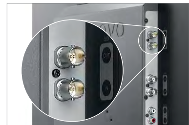
SDI inputs bring forth megapixel images without interruption