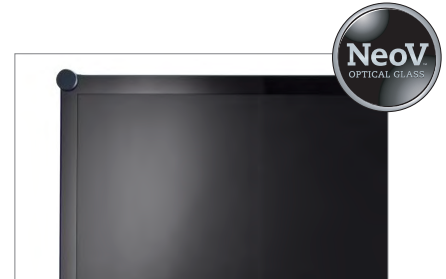
NeoV™ Optical Glass and durable metal casing for water, dust and scratch resistance