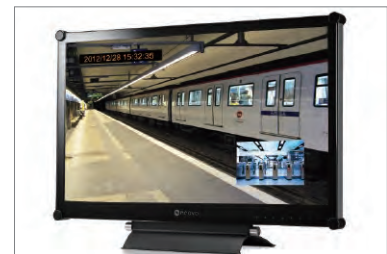
Viewing versatility with PIP and PBP