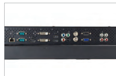
Multiple video inputs (VGA, DVI, HDMI, BNC, S-Video, DisplayPort and Component) allow for effortless system integration