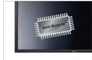
Anti-Burn-in™ technology prevents image sticking