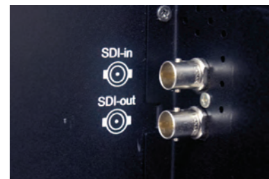
SDI inputs bring forth mega-pixel images without interruption or delay