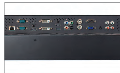
Multiple video inputs (VGA, DVI, HDMI, BNC, S-Video, DisplayPort and Component) allow for effortless system integration