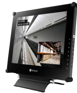
Flexible image viewing options such as PIP/PBP, freeze, 180° image rotation