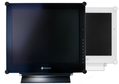
Available in black or white