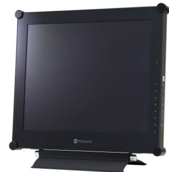
Front-panel keypad with Input Select, Screen Menu, Contrast and Brightness controls for quick adjustments