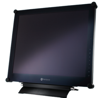
Front-panel keypad with Input Select, Screen Menu, Contrast and Brightness controls for quick adjustments