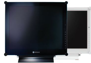
Available in black or white