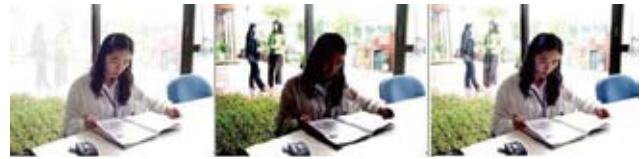
Over-exposure to diminish background